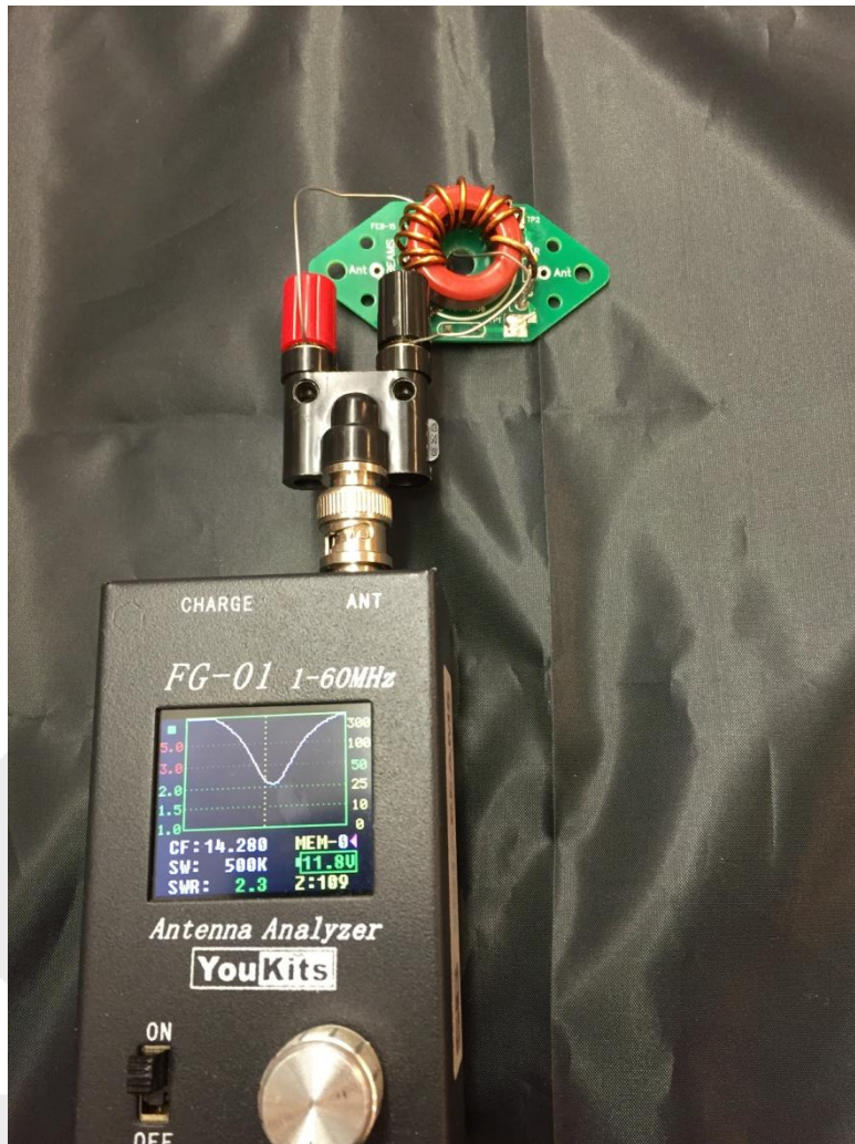
Photograph shows a trap being tested

Adjust the resonant frequency by moving the turns on the toroid. Squeezing the turns together will lower the resonant frequency of the trap.